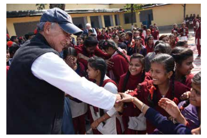
Taking part in a Sparsh leprosy awareness campaign in Jharkhand, India, 2018

from entering China. For my part, I wrote to the International Olympic Committee as well as the Chinese leadership and the mayor of Beijing, and in two weeks the matter was resolved.