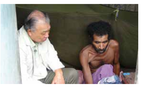
Meeting a man abandoned by his family on a visit to Biwak Island, Indonesia, in 2014. Subsequently, the man was able to resume his life as a fisherman.

We're not there yet. What matters is to keep heading toward it, not how far away it is. In a tunnel, if you keep going you will eventually reach the other end. In that sense, I think it's more important to work together in the same direction to achieve our goal,