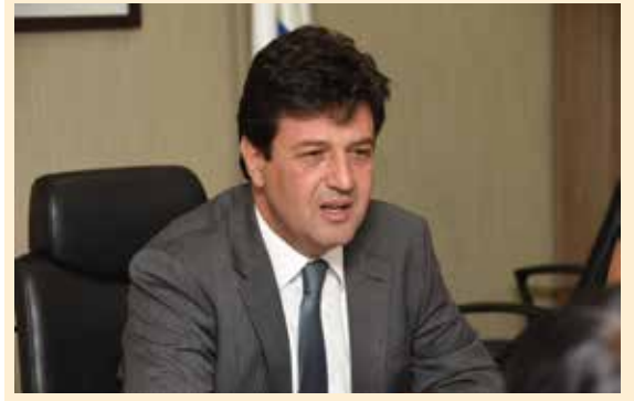
Health Minister Mandetta is an orthopedic surgeon

That live broadcast went on to be viewed hundreds of thousands of times. Moreover, not only was the broadcast seen by a huge number of people, it also attracted some 18,000 comments.