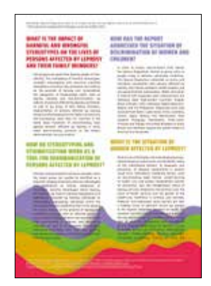
A fact sheet summarizing the report.