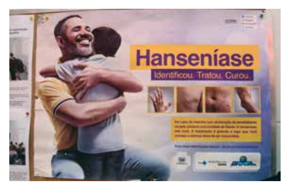
Health poster for Hansen's disease: "Identified. Treated. Cured."

Beliefs stemming from the Bible that leprosy is synonymous with uncleanliness, decay, corruption and filth are still very much present in countries where Hansen's disease exists and even in those where cases are few and far between. Among health professionals, too, there are individuals who display discriminatory attitudes toward leprosy, and these attitudes can be communicated to patients, their families and the wider community.