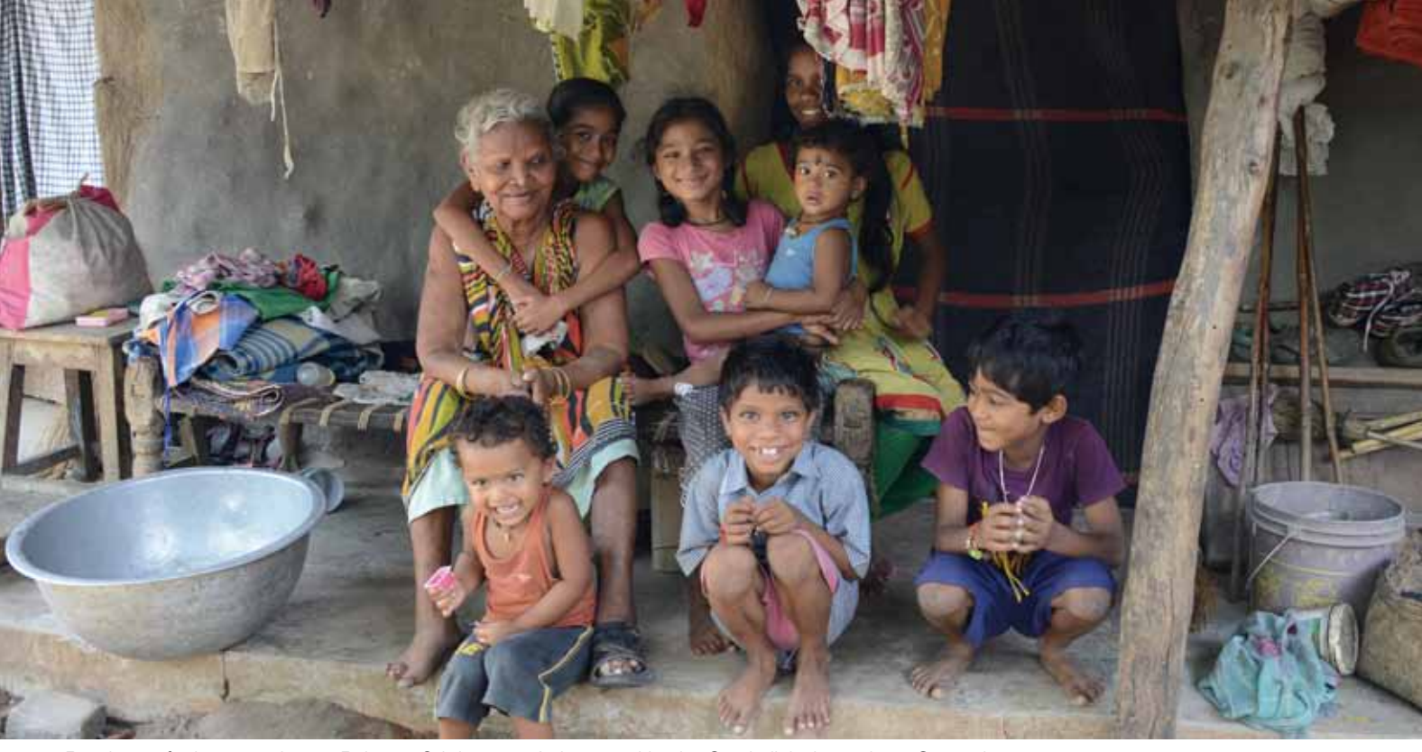
Residents of a leprosy colony in Balangir, Odisha state, India, visited by the Goodwill Ambassador in September.