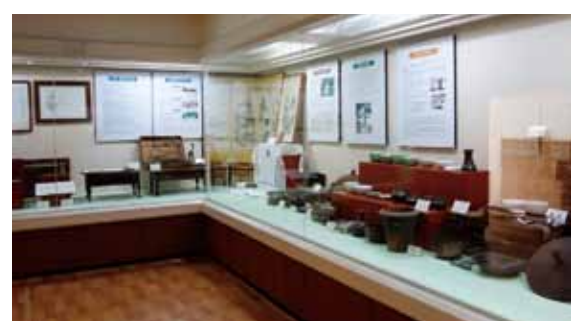
The island's museum depicts the lives of patients.

While the audience seemed to consist mainly of hospital staff, what I found remarkable was how many young volunteers attended the forum. Many,