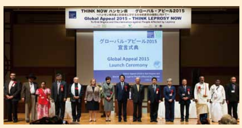
Prime Minister Abe (center) headed the list of dignitaries at the launch ceremony.

This column usually deals with my travels away from Japan. In January, however, my place was in Tokyo for the launch of the tenth Global Appeal to End Stigma and Discrimination against People Affected by Leprosy. I am very grateful to the International Council of Nurses (ICN) for endorsing this year's appeal and I look forward to their continued support.