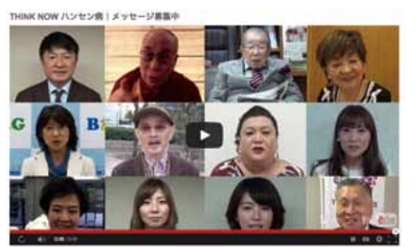
Some of the 1,600 contributors to the online campaign

kind of disease it is. I think that if everyone learns about leprosy, discrimination against it will decrease. Then the people who have to beg or hide away in leprosy villages can live freely. In that sense, I hope that everyone can learn little by little about leprosy and take action."