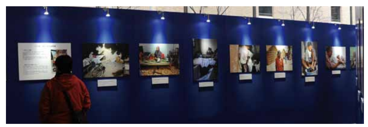
Photo exhibition depicts the lives of people affected by leprosy around the world.

"To think about leprosy is to think about people" was the title of a recent photo exhibition held in Tokyo featuring the work of Nippon Foundation photographer Natsuko Tominaga.