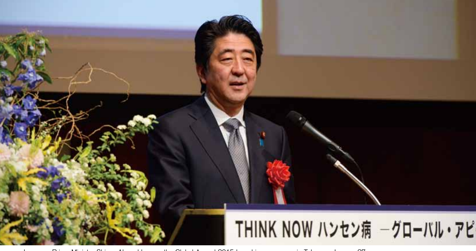
Japanese Prime Minister Shinzo Abe addresses the Global Appeal 2015 launching ceremony in Tokyo on January 27.