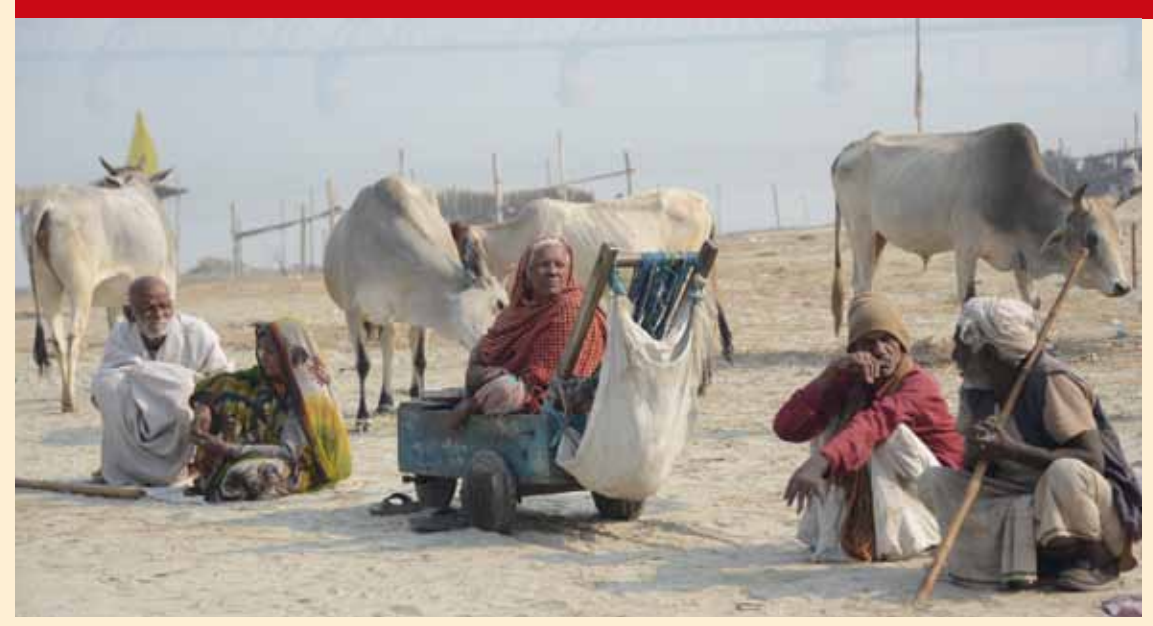
In Faizabad, where many elderly colony residents must beg in order to make a living

accompanied them to their usual spot by the side of a river, knowing that my dream of seeing an end to begging among people affected by leprosy in India is far from being realized.