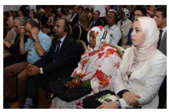
Around 120 people attended the symposium.

"Even though you may be medically cured, you