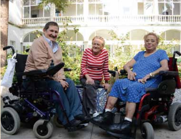
(Above) A view of Fontilles and its wall; (right) some of the 35 remaining residents

were carried out on his family members and it was found that three of his younger brothers also had leprosy.