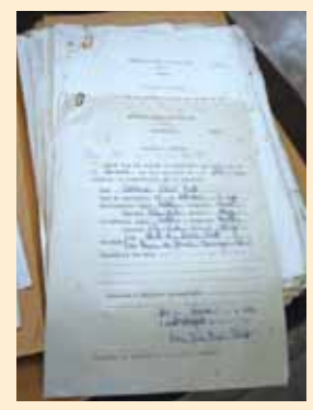
Discussing a 10-yearold photo at Rovisco Pais (far left); the glass panels that kept children and their leprosy-affected parents apart (left); discarded records (above)