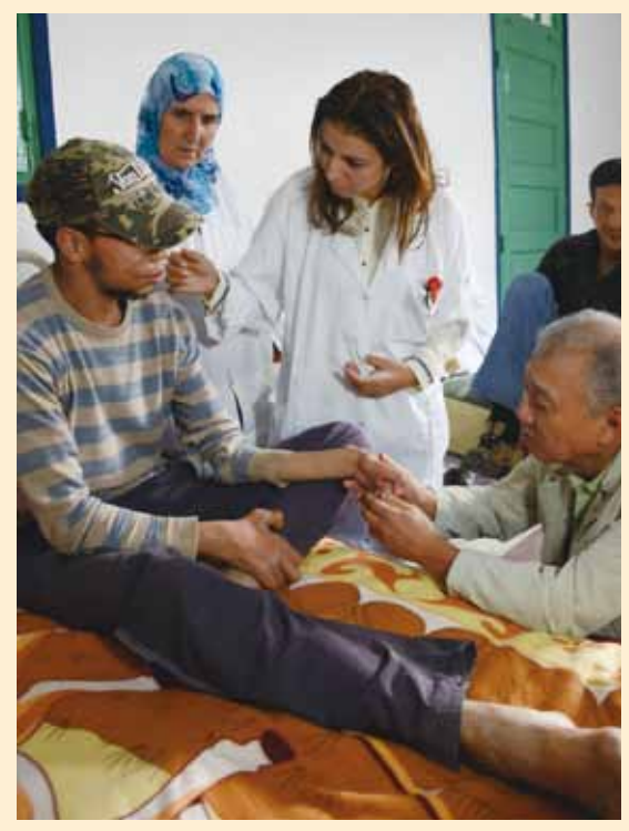
At the National Leprosy Center, Casablanca

As patient numbers have declined, so budgets have been cut, leaving areas of the hospital unused and falling into disrepair. The lab has closed, with patients requiring biopsies referred to a nearby TB