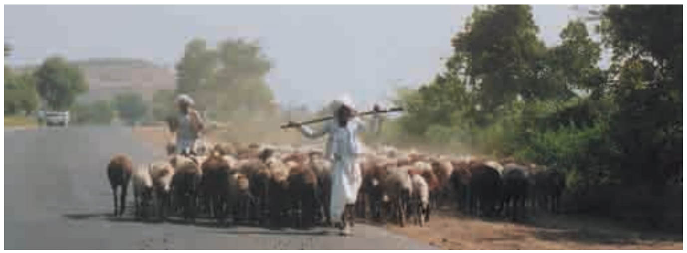
Country scene in Nagpur, India