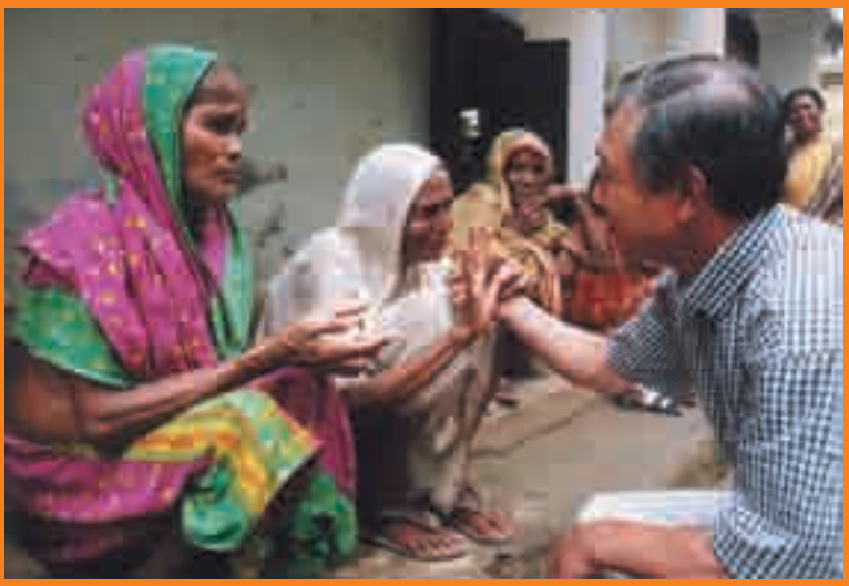
Visiting a colony in Orissa, India

ast year, as WHO special ambassador for the elimination of leprosy, I made three visits to India, and also went to Madagascar and Angola. I wish to express my heartfelt appreciation to the people I met for their dedicated efforts. Nevertheless, frankly speaking, I strongly feel that a sense of urgency is lacking. We have only two years left in which to achieve the goal of elimination. A lot more needs to be done.