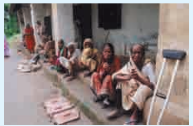
Residents of a colony in Orissa

In July, I went to the northeastern state of Orissa. After Bihar, it is the state with the highest prevalence rate in India, with 7.3 leprosy patients per 10,000 inhabitants at the time of my visit.