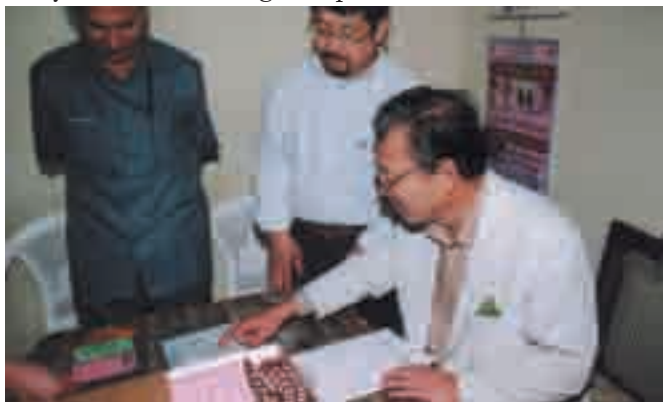
Checking MDT at a Primary Health Center in Nagpur, Maharashtra

In some areas, leprosy elimination may take longer, in spite of the best efforts being made. This is largely a result of the late start of MDT implementation, unusually high prevalence levels to begin with, and certain unknown epidemiological factors. However, this is likely to apply only in certain limited areas and not likely to influence the global picture.