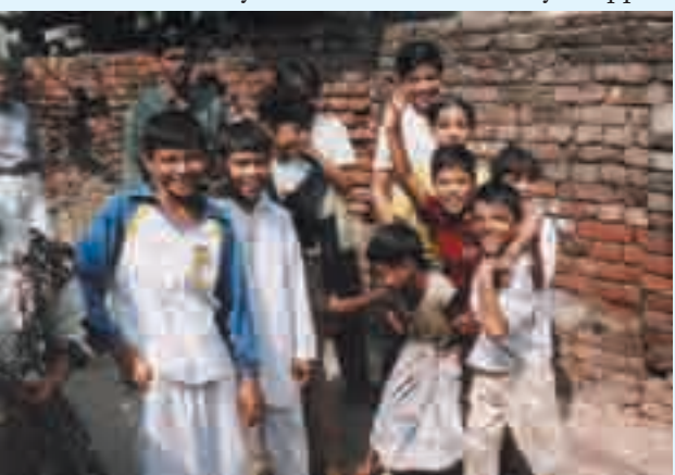
Children in Garden Reach, Kolkata

Elimination activities in West Bengal generally seem to be making good progress, although from what I have seen there are still a few problems. First, there are flaws in the management of MDT. The availability of drug supplies at Primary Health Centers varies, and there are insufficient stocks of children's dosages—a point I was asked to convey to the relevant authorities in Delhi. Second is the problem of defaulters—patients failing to complete treatment. With the integration of leprosy services into the general healthcare system in Kolkata, responsibility for case-holding has passed to local government. As a result, many patients have had to change the clinic where they go for treatment, or have found that they have been inadvertently dropped