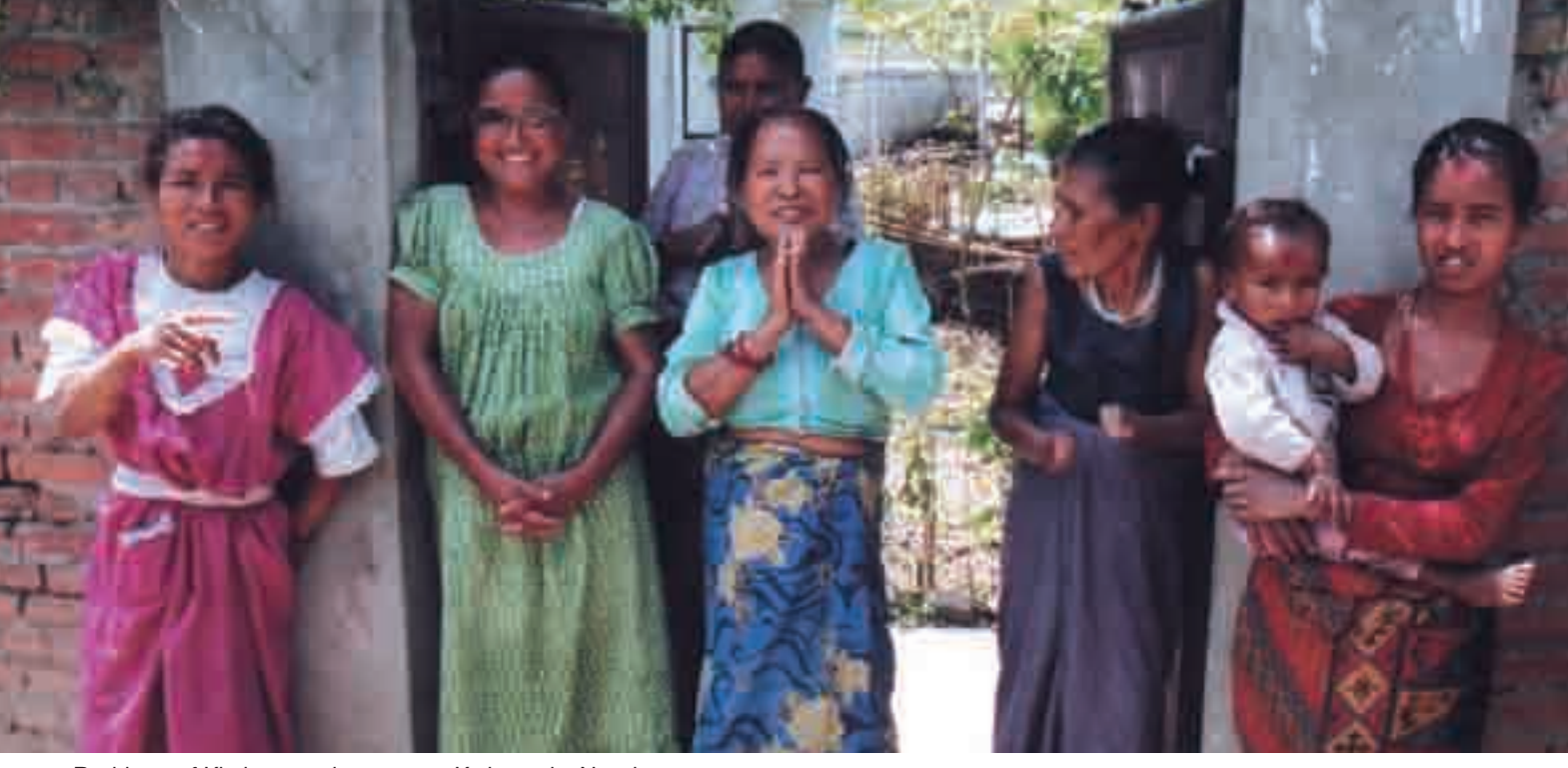
Residents of Khokana settlement near Kathmandu, Nepal