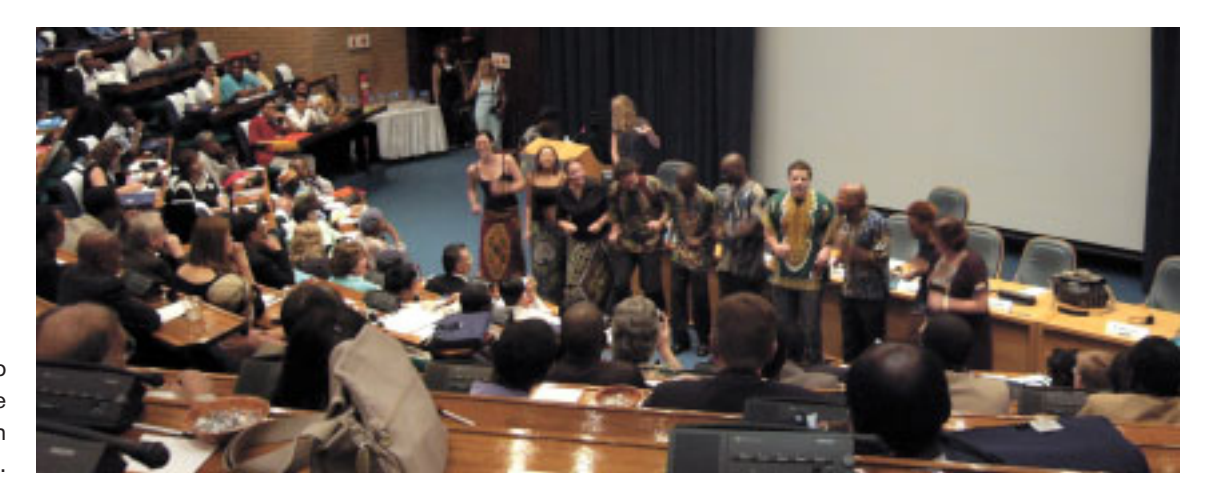
A choir warms up delegates before the start of the African Leprosy Congress.

beings like anyone else. We are useful to the community."