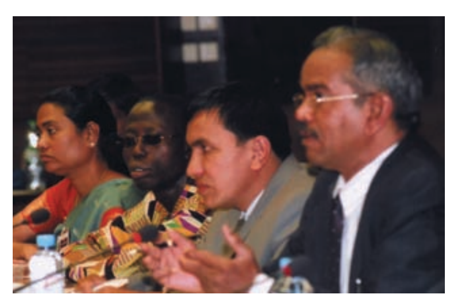
After beating the disease, these cured persons are courageously speaking out

On the other hand, Lee Casey remarked that few people had been regarded for so long, or so universally, as suffering from a divine punishment,