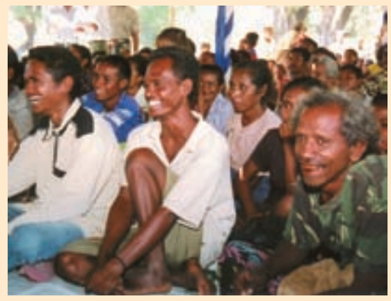
Recovered persons in Oecusse enjoy festivities to celebrate successful completion of their treatment.

According to the most up to date figures, 625 new patients have been registered in the past two years, and the current prevalence rate is 3.9/10,000. Over half — or 388 — live in an enclave called Occusse.