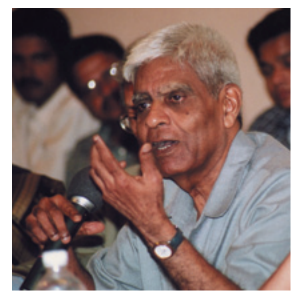
Dr. Noordeen: issue of disability will persist

prevalence globally has been reduced by over 94%. At the country level it is expected that all but five or six countries will have reached leprosy elimination by the end of 2005.