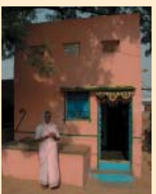
Bunaken Island, North Sulawesi (left); Bharat Mata Kusht Ashram, Haryana State (middle, right), where an old dwelling reminds of times past

institutions that seemed to symbolize different phases of the fight against leprosy. The Daya Leprosy Hospital has 220 beds but almost three-quarters of them are empty. Now that MDT is readily available, I feel there is no longer a need for a specialist hospital such as this today.