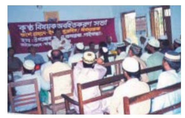
Leprosy awareness training for religious leaders

The NLEP has thus allocated a further two years to achieve its goals.