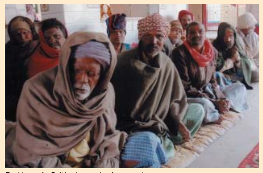
Residents of a Delhi colony gather for a meeting.

The next day, I drove three hours south of Jaipur to Ajmer, a popular pilgrimage center for both Hindus and Muslims. Halfway along the pilgrimage route is a deprived area with a history of more than 100 years. Here some 3,000 people live, of whom approximately 2% have leprosy or once had the disease.