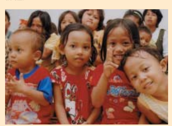
Children at the Babat Jewarat colony in Surubaya

In Surabaya, I visited the 93 families living in Babat Jerawat leprosy settlement. The people I met seemed in good heart, and the children ran about wearing big smiles. There might be discrimination outside the settlement, but within it there was a positive spirit and a sense of community. Yet I can't help thinking that had there been an effective IEC strategy in place, there would have been no need for a separate village of persons affected by leprosy at all.