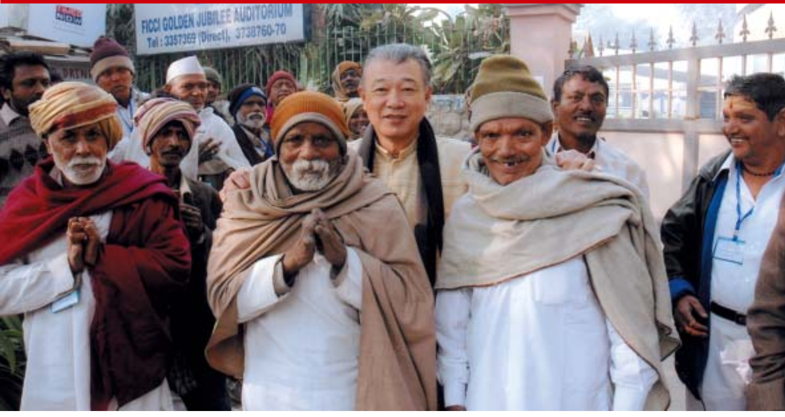
Yohei Sasakawa (center) with delegates to India's first-ever national conference of persons affected by leprosy held last December in Delhi.