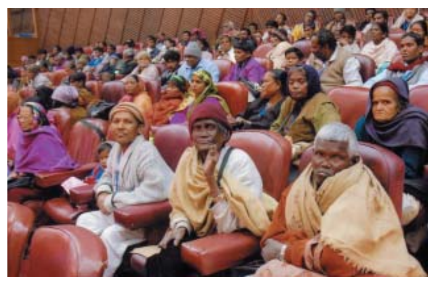
Delegates came from all over India for the landmark meeting.

For many of the colony representatives, it was their first experience to participate in a national conference. It provided them with the opportunity to link up with other persons affected by leprosy from all over India, and inspired the hope that by joining forces they could work together to build a better future. The bursts of applause that regularly punctuated the Federation of Indian Chambers of Commerce and Industry Golden Jubilee Hall were testimony to the feelings of empowerment