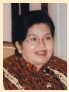
Health Minister Siti Fadillah Supari