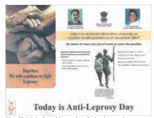
It's official: India achieves the elimination goal.

As the newspaper ad also said, "Together, we will continue to fight leprosy."