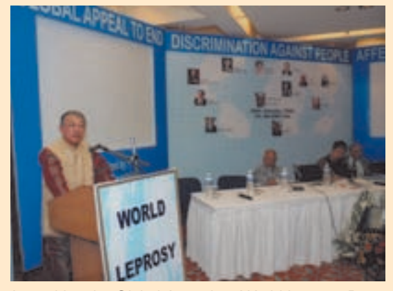
Launching the Global Appeal on World Leprosy Day

On January 29 I was in Delhi to launch the Global Appeal to Eliminate Stigma and Discrimination against Persons Affected by Leprosy (full text on page 3).