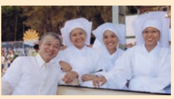
Posing with sisters of the Order of St. Paul de Chartres.

This was followed by the unveiling of a marker at the landing site, and the release of 100 doves and balloons. Many speeches were made, and in my own remarks I heralded Culion's transformation from an island of despair to a place of hope.