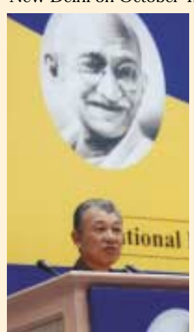
Speaking in Delhi

The following month I returned to India to attend the 2nd National Conference on the Integration & Empowerment People Affected by Leprosy in New Delhi on October 4. This conference is