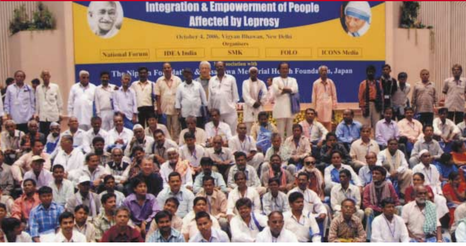
Delegates to the second national conference of people affected by leprosy held in New Delhi, India, on October 4, 2006