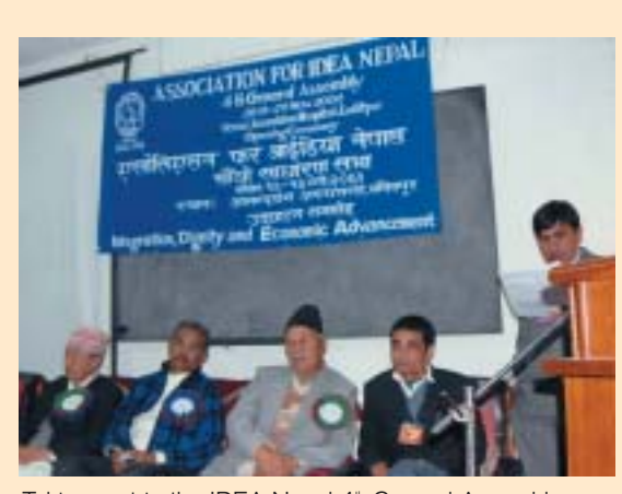
Taking part in the IDEA Nepal 4th General Assembly

At present, PR stands at 1.65 and officials