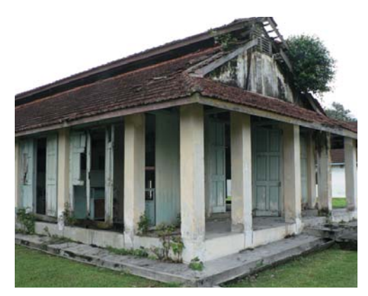
Disused building at Sungai Buloh

Malaysia's health ministry announces plans to preserve leprosy center's rich history