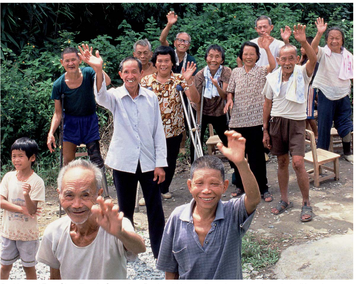
Residents of Teng-Qiao village in Guangdong Province bid farewell to volunteers at the end of a JIA work camp.

Photo credit All photos on pages 4-6 courtesy of JIA/FIWC