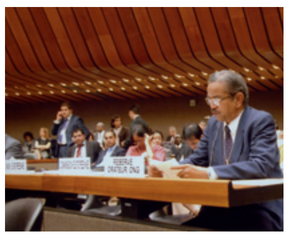
Dr. P.K Gopal reads from the Oral Statement to the Sixth Session of the Human Rights Council on September 24, 2007: "Tens of millions of people cured of leprosy and their families are marginalized from society, suffering from stigma and social discrimination."

remote location of leprosy villages also erect barriers to being educated.