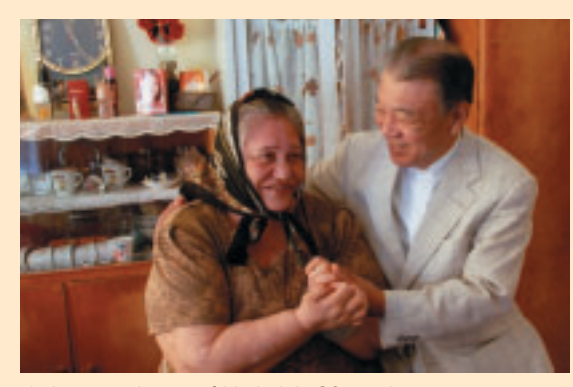
At home with one of Umbaki's 30 residents

and a half hours. The barren landscape and tenuous link with the outside world served to underline the isolation of the sanatorium.