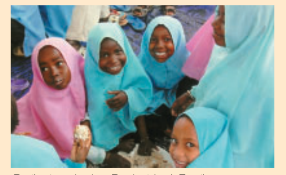
Pupils at a school on Pemba island, Zanzibar

From the DRC I traveled to Tanzania. When I last visited in 2005, I had promised to come back and celebrate when the country passed the elimination milestone. Hence it was with real pleasure that I returned to mark Tanzania's achievement.