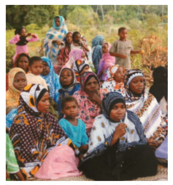
People affected by leprosy on Penba island, Zanzibar

This is important for a number of reasons. First is the issue of disability. Among new patients today, 12% already have grade II disability, which