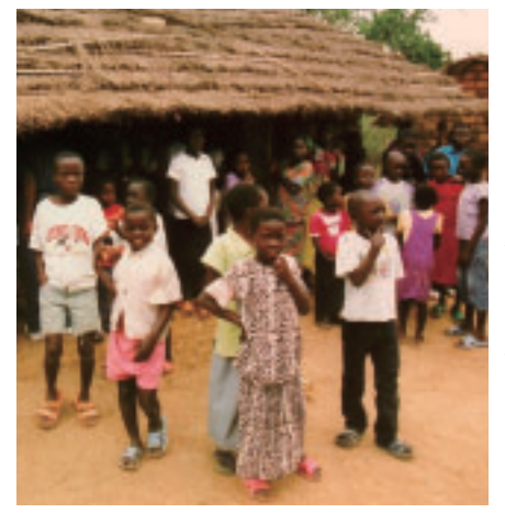
Children in Kivuvu, Bas-Congo Province