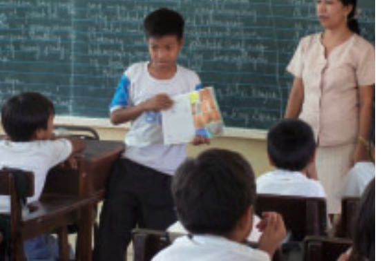
School for skincare: boy with observation guide (left), hands-on instruction (right)

and projects will be implemented in four more municipalities in Ilocos Norte this year. The goal is to cover all 23 municipalities and use the lessons learnt to motivate other provinces to apply the strategies.