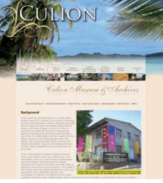
Nature and history are captured in this screen shot from Culion's new website, launched in April (www.culion.net)

Culion, we like to say, is truly a "paradise regained." Please come and see for yourself.