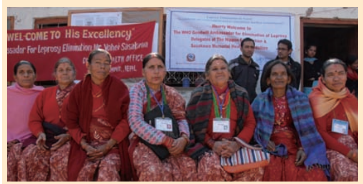
Female community health volunteers in Kavre District, Nepal, in January.

The Goodwill Ambassador congratulates Nepal on achieving elimination, attends a meeting of the National Forum in Chennai and launches Global Appeal 2010 in Mumbai.