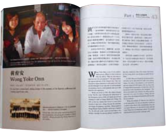
One of nine oral histories presented in the book, which is a bilingual Chinese- and English-language publication

In April 2011, 78 acres of Sungai Buloh were gazetted as a national heritage site. For this, the members of the Save Valley of Hope Solidarity Group must take credit. In championing the cause of Sungai Buloh, they are to be congratulated for underlining the importance of preserving not just historical buildings but also the human dignity of an isolated and largely overlooked community.