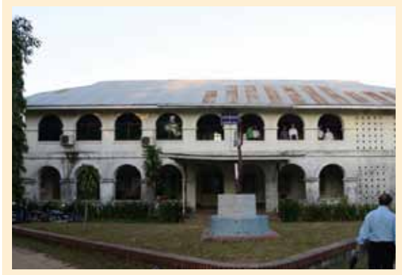
With a resident of Mawlamyine Christian Leprosy Hospital (top); hospital exterior (above)

surgery, physiotherapy, eye care, and prevention of disability education. There is also a workshop for making mobility aids and footwear for leprosy. In addition, the hospital offers livelihood training for people affected by the disease and their families.