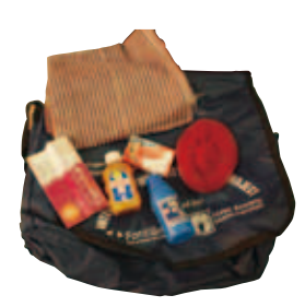
Example of a self-care kit

them that leprosy is cured after a course of MDT, especially if they see that a person has more disability than he had at the time of starting treatment.