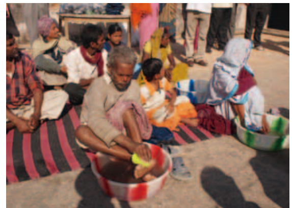
Practicing self-care in India

Nowadays, however, many people come early for treatment when they just have changes in their skin. They hope to be cured with no residual problems. Unfortunately, however, this is not always possible.